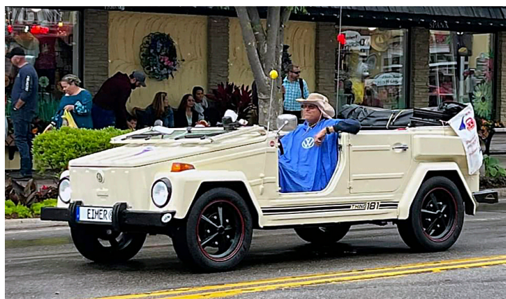
Singin' in the rain

Everyone, let's have a great, safe 2023 and an even better 2024.