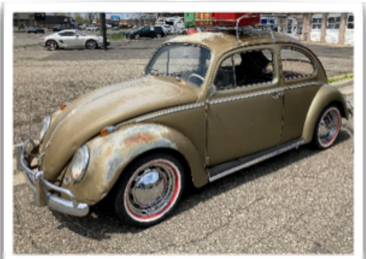
A Beetle at Munk's Motors Cars and Coffee

The question is how to fit it all in? If you look into it, you could go to an event somewhere almost any day or night of the week; be it a cruise, car show or gathering depending on how far you wish to drive. The cruises are spaced out a little all summer in various locals, often times competing for your attendance on the same day. They are all designed to get you and your ride out there to participate, not only by showing off your pride and joy, but also to appreciate other people's vehicles and efforts. Part of that experience is to talk shop about maintenance, repairs and restoration. You might learn what worked for them, what didn't, tools, tricks, shops, and part suppliers. The other part of the experience is the social interaction and camaraderie we were all missing over the last few years. A big part of club membership is sharing all of this with other members, using the network to improve our efforts and also to help others through the rough patches. Occasionally we all have those moments when we can't see all of the potential solutions to a problem. In brainstorming and bouncing ideas around with others, we can sometimes reach a different perspective and come upon a viable solution. Safe travels to all and enjoy the ride.