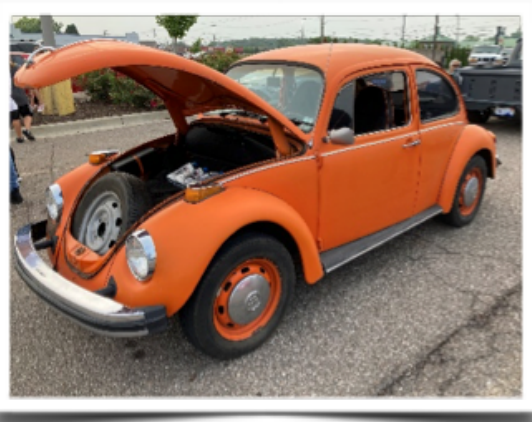
A Beetle at a Down River Car Meet